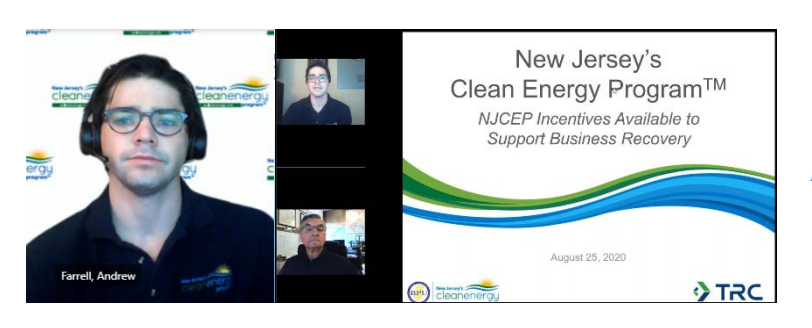
FY21 meetings and presentations remained virtual due to COVID-19.