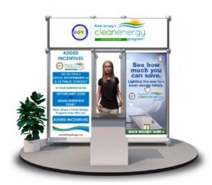
The team shifted and setup virtual conference exhibitions where a live account manager was at the booth and other staff networked with vendors and conference attendees.