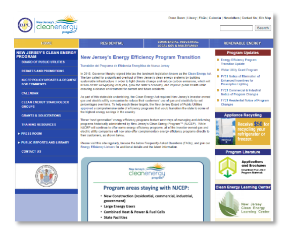
NJCEP's Transition Landing Page was created in English and Spanish including a custom-made GIS Application to verify gas and electric utility companies based on an address.