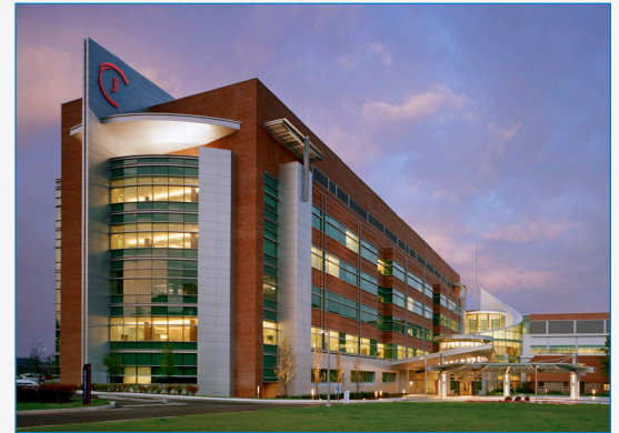
When Jersey Shore University Medical Center built its Northwest Pavilion, the expansion included two new gas-fired co-generation units, financed with the help of a $1 million New Jersey Clean Energy Program incentive.

Among those features, the $300 million expansion included installation of two new gas-fired co-generation units. The combined heat and power (CHP) units were installed with help from financial incentives through New Jersey's Clean Energy Program™ .