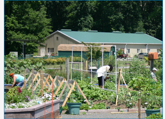
Middlesex County's Agricultural Extension building provides office space for the EARTH Center in Davidson's Mill Pond Park (pictured above). Energy efficiency improvements reduced monthly utility expenses by half.