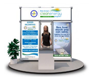
The team shifted and setup virtual conference exhibitions where a live account manager was at the booth and other staff networked with vendors and conference attendees.