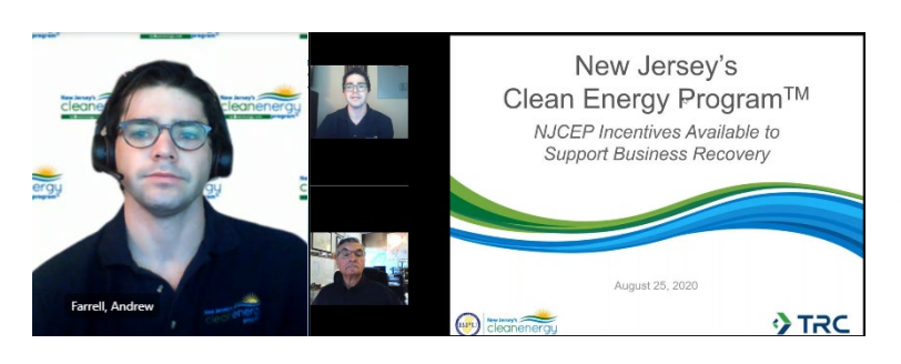
FY21 meetings and presentations remained virtual due to COVID-19.