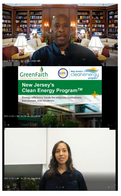
TRC presented in October 2020 for NJCEP at the Black Issues Convention in conjunction with GreenFaith. As the convention platform changed due to COVID, the outreach team was flexible and put together a video.

The Outreach Team will continue to refine the NJCEP presentation in order that the infographic and presentation flow addresses the audience appropriately based on their specific needs. The NJCEP portfolio overview infographic is used in most presentations to give an overview of the all programs available before diving into the discussion topic of the core presentation.