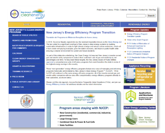
NJCEP's Transition Landing Page was created in English and Spanish including a custom-made GIS Application to verify gas and electric utility companies based on an address.