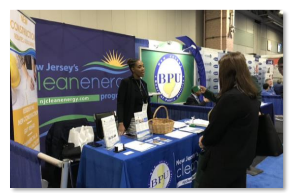
The New Jersey League of Municipalities' 107<sup>th</sup> annual conference provided meaningful face-toface networking and a showcase of BPU and NJCEP programs in a post-COVID-19 environment

An Account Manager will coordinate LGEA outreach efforts with the organization of informational campaigns, development of newsletter content, and involvement in annual Organizational involvement will conferences. continue with the Association of Counties, Conference of Mayors, School Buildings and Grounds Association, School Boards Association, and League of Municipalities. Equitable outreach for targeted overburdened towns and authorities will be included during FY24.