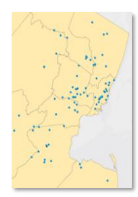
Small Business Stimulus

• Increased outreach to K-12 schools in underserved and overburdened communities, women- and minorityowned small businesses, business development organizations, and minority chambers of commerce in New Jersey. Outreach provided these audiences with NJCEP program information including the federally funded SSB Stimulus Program.