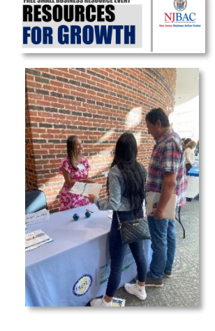
NJ Business Action Center Hispanic Business Owners Event

A Hispanic Account Manager oversees Spanish educational outreach, working with the Outreach Team to address the needs of Hispanic customers. This service will continue to align with new FY24 programs and will be a key outreach resource when engaging with bi-lingual organizations including the Statewide Hispanic Chamber of Commerce, and regional Chamber of Commerce -Hispanic Business Committees.