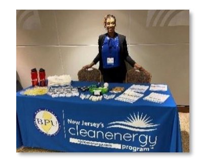
TRC exhibited at the Association of New Jersey's Environmental Commission's 49th Annual Environmental Congress, their first in-person event since the COVID-19 pandemic