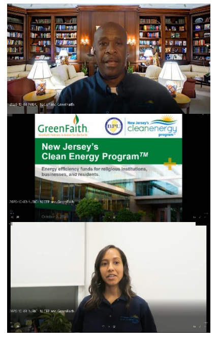
TRC presented in October 2020 for NJCEP at the Black Issues Convention in conjunction with GreenFaith. As the convention platform changed due to COVID, the outreach team was flexible and put together a video.

The Outreach Team will continue to refine the NJCEP presentation in order that the infographic and presentation flow addresses the audience appropriately based on their specific needs. The NJCEP portfolio overview infographic is used in most presentations to give an overview of the all programs available before diving into the discussion topic of the core presentation.